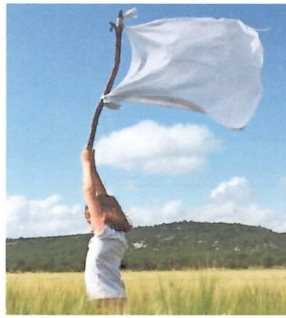
We come in peace