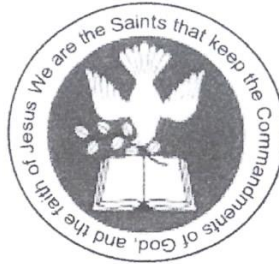
We come in brotherhood